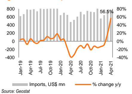
Figure 4: Goods imports